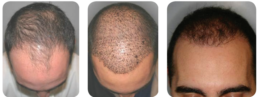
Left: Pre-op. Middle: 8 days after procedure. Right: 8 months after procedure.