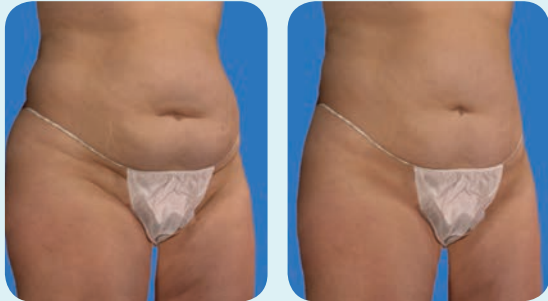
Left: Pre-op Tummy Tuck and Liposuction Right: Simulated Post-op Tummy Tuck and Liposuction

The breast augmentation simulation tool is valuable in helping women choose their implant sizes. Various implant types and sizes can be placed and viewed as a 3-dimensional image. We have used similar 3D imaging technology for breast surgery over the last several years and can't imagine doing breast consultation without this extraordinary tool.