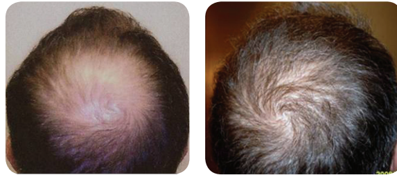
Left: Pre-op. Right: 8 months after procedure.

NeoGraft is the least invasive procedure for hair transplantation with minimal risk of bleeding and damaging blood vessels and nerves. With this device each hair unit from the back of the head (donor area) is harvested individually (units) and placed in the thinning or balding areas on the top of the head. Hair transplantation is successful because the hair in the back of the head is genetically programmed not to fall out. This hair transplant can be performed without a scalpel and leave no visible linear scar for faster healing and less discomfort. NeoGraft hair restoration system also causes less damage to grafted hair follicles, drastically increasing the chances that your hair transplant will be successful.