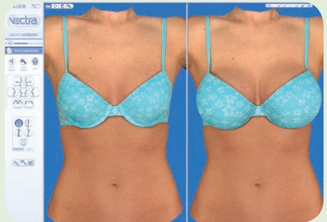
Left: Pre-op image before using Vectra 3D imaging Right: Simulated Breast Augmentation after using Vectra 3D imaging