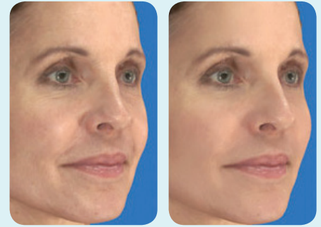
Left: Pre-op dermal fillers Right: Simulated post-op dermal fillers

We now offer Vectra 3D Imaging for our facial, breast and body procedures . We are now able to simulate the expected results of a variety of aesthetic procedures, including breast augmentations, breast lifts, rhinoplastys, chin augmentations, facelifts, tummy tucks, liposuction and more! In addition to simulating the results of surgical procedures, the Vectra Imaging system can simulate the results of non-invasive procedures, such as those involving the use of injectable fillers. The 3D image will also allow you to see yourself and your possible results from all angles, as well as side-by-side.