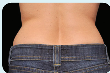
Left: Before CoolSculpting flanks. Right: After CoolSculpting flanks.

Say good-bye to those stubborn fat cells for good! The newest innovation in fat cell elimination is coming to CaloSpa! CoolSculpting® will permanently destroy fat cells using cold energy. CoolSculpting is great for areas such as your "love handles" and belly fat. This FDA approved procedure takes about an hour per treatment area and has no "down time". CaloSpa is offering 20% OFF CoolSculpting Treatments at its 11th Annual Open House. Start sculpting your new figure!