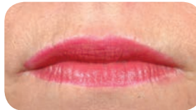
Left: One of our patients before Dermal Filler in the lips and marionette lines. Right: The same patient after Dermal Filler in the lips and marionette lines.